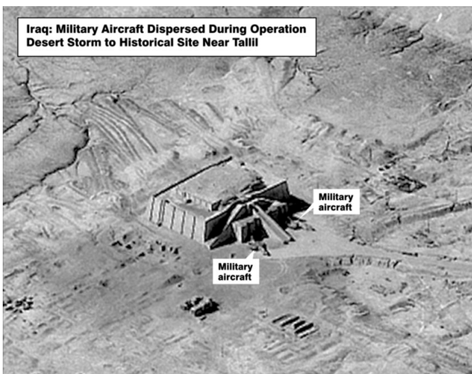
Figure 28.2 Iraqi military aircraft stationed near the Temple of Ur. Image: US Department of Defense, Conduct of the Persian Gulf War: Final Report to Congress (April 1992), https://apps.dtic.mil/dtic/tr/fulltext/u2/a249270.pdf , 133.

Perhaps the most widely discussed example of adherence to cultural heritage protection rules influencing a US targeting decision was when the Iraqi Air Force placed